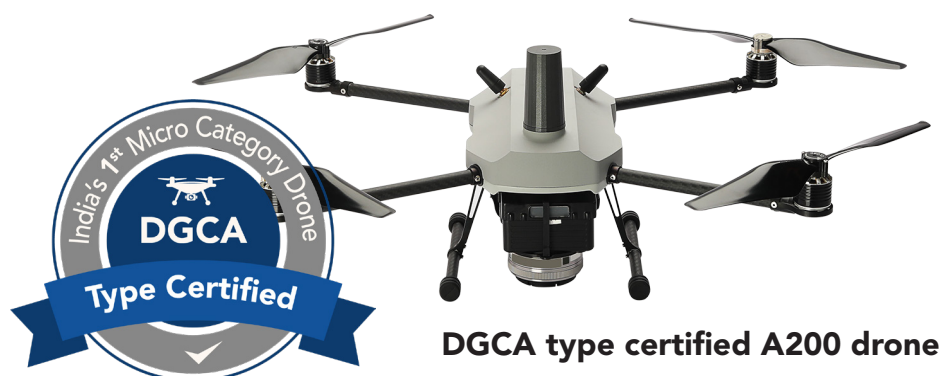
DGCA type certified A200 drone