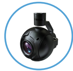
Thermal Infrared Camera