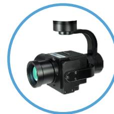
Thermal Infrared Camera