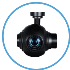
10X Optical Zoom Daytime Camera