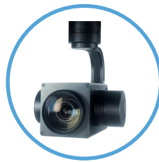
30X Optical Zoom Daytime Camera